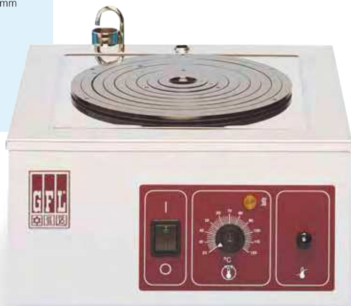
1023 Steam Bath, 7 litres

GFL Water Baths convince through their varied ranges of application. For instance, the Steam Bath's square cover frame (W 265 mm x L 265 mm) is removable. Its 9-part set of rings, made of heat-resistant plastic material can be parted. Its diameter can be varied in approx. 20 mm steps (min. 32.5 / max. 173.5 mm).