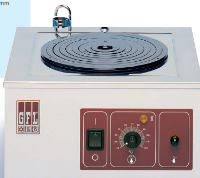
1023 Steam Bath, 7 litres

GFL Water Baths convince through their varied ranges of application. For instance, the Steam Bath's square cover frame (W 265 mm x L 265 mm) is removable. Its 9-part set of rings, made of heat-resistant plastic material can be parted. Its diameter can be varied in approx. 20 mm steps (min. 32.5 / max. 173.5 mm).