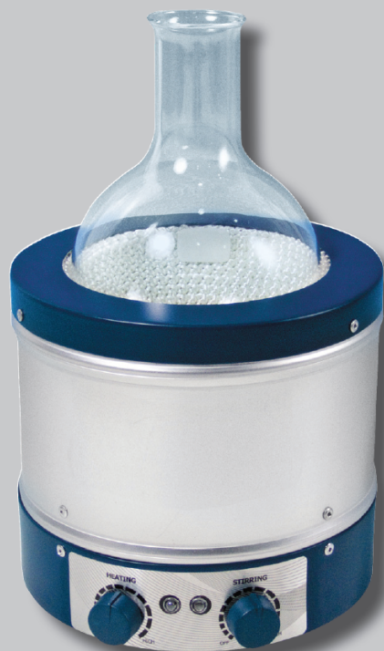
1.000 ml flask heating mantle