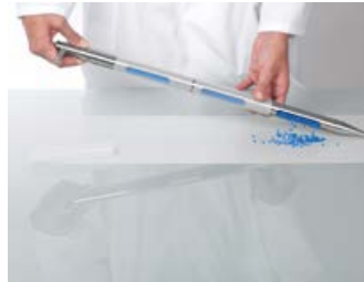
Sealing sleeves zone sampler