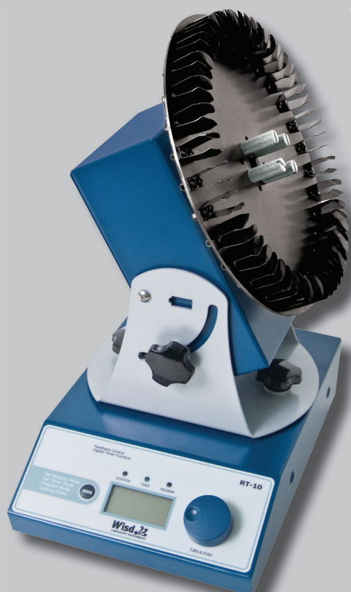
RT-10 with disk WRT120