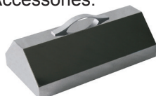
Dome lid for shaking water bath WSB