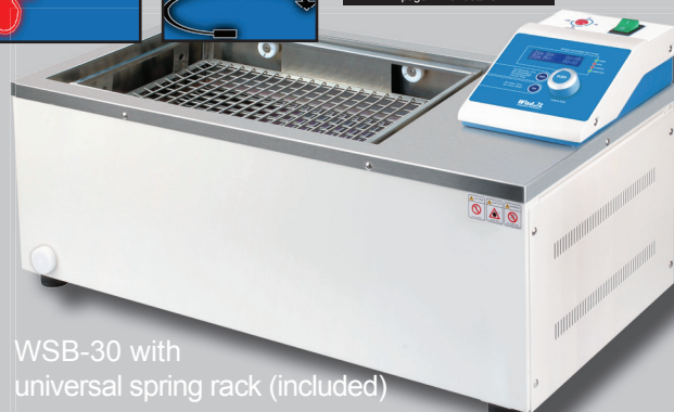
WSB-30 with universal spring rack (included)