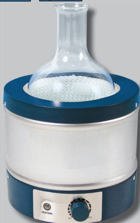
1.000 ml round flask heating mantle