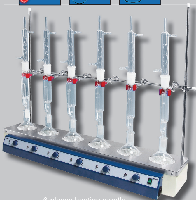
6-places heating mantle with three rods and two hooks (included)