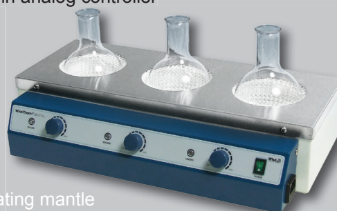
3-places heating mantle