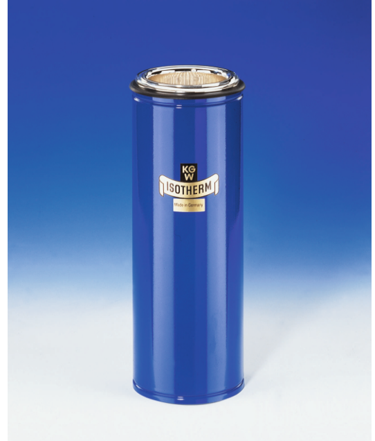
Dewar flask 9 C