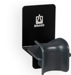
Wall mount for 1 Transferpette® S single- or multi-channel pipette.