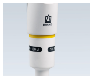
Integrated shaft coupling