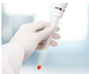
Narrow centrifuge tubes

Individual nose cones and seals can be easily removed for cleaning or replacement