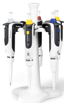
Pipette Package 2