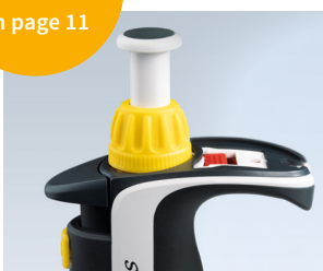
Easy Calibration technology