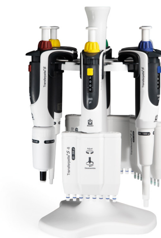
Bench top rack for 6 Transferpette® S single- or multi-channel pipettes.