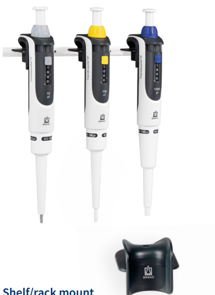
Shelf/rack mount for 1 Transferpette® S single- or multi-channel pipette.

With holders and stands, the devices are always properly stored and close at hand for the next application.