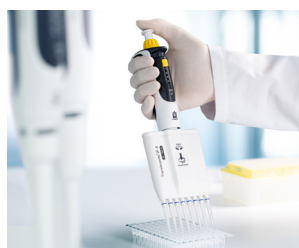
Working with PCR plates