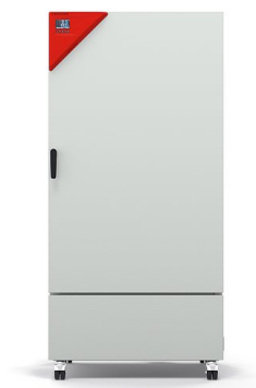
Model KB ECO 400