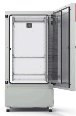
Model KB ECO 400