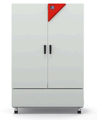
Model KB ECO 1020