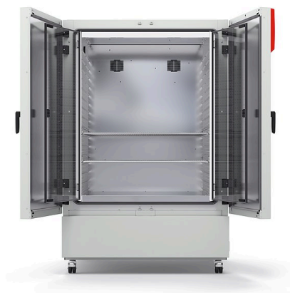
Model KB ECO 1020