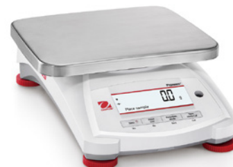
PX12001 and PX12001/E model