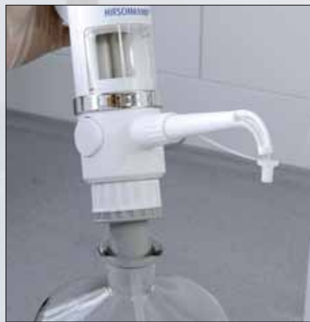
Ground adapter for direct reagent extraction from a ground bottle The NS 29/32 ground adapter enables secure use of the basic unit on standard ground bottles.