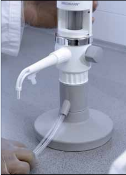
Base support instead of bottle attachment The base support enables suctioning of the medium directly from a separate storage container using a hose.