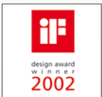
2002 – iF Design Award, Hanover