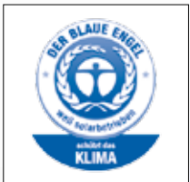
2002 – Blauer Engel