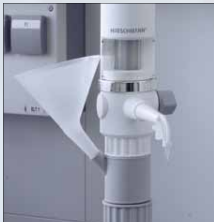
Adapter with NS 12/21 filling tube for funnel The adapter with standard ground 12/21 filling tube enables problem-free filling of medium through a funnel - without unscrewing the basic unit.