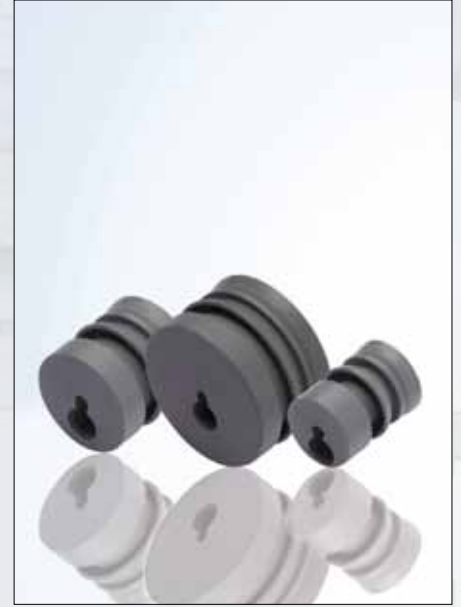
Spare piston units The piston can be replaced easily by the user without the need for tools.