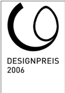
2006 – German Design Award (Designpreis Deutschland) Design Council