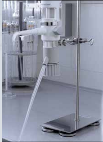
Stand clip for fixing the basic unit The stand clip also facilitates use of solarus® in a stand assembly.